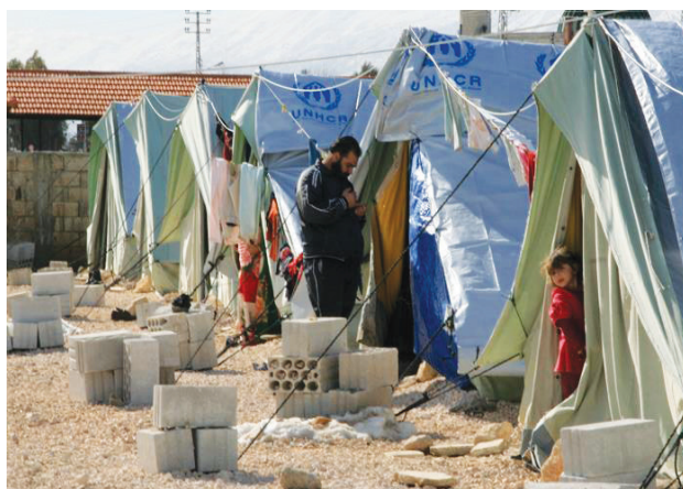
United Nation's aid to refugees

Before the Second World War, the Jews were tortured in Germany. Their citizenship and property was confiscated. Due to this, the Jews became refugees. In 1971, the people in East Pakistan turned refugees and came to India seeking refuge due to political and religious persecution. In the last few years due to the war-like