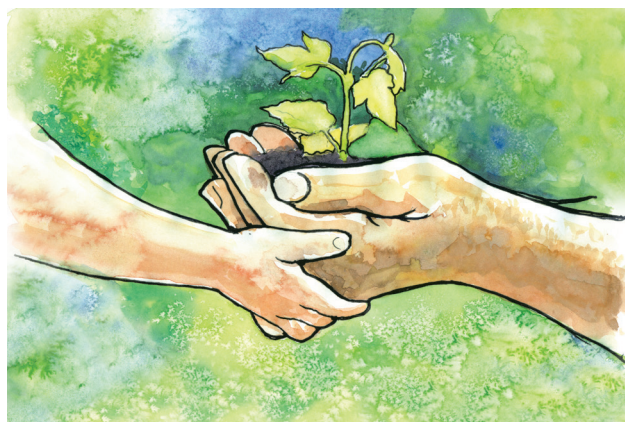
Conservation of environment : a legacy

The visible effects of the decline of environment are extinction of species of plants and animals, decrease in the fertility of soil, water shortage, fluctuation in the proportion of rainfall, global warming, drying up of rivers and lakes, pollution of rivers and seas, incidence of newer diseases, acid rain, thinning of the ozone layer, etc. Even if some of the effects are restricted to particular nations, these problems reach global proportions,