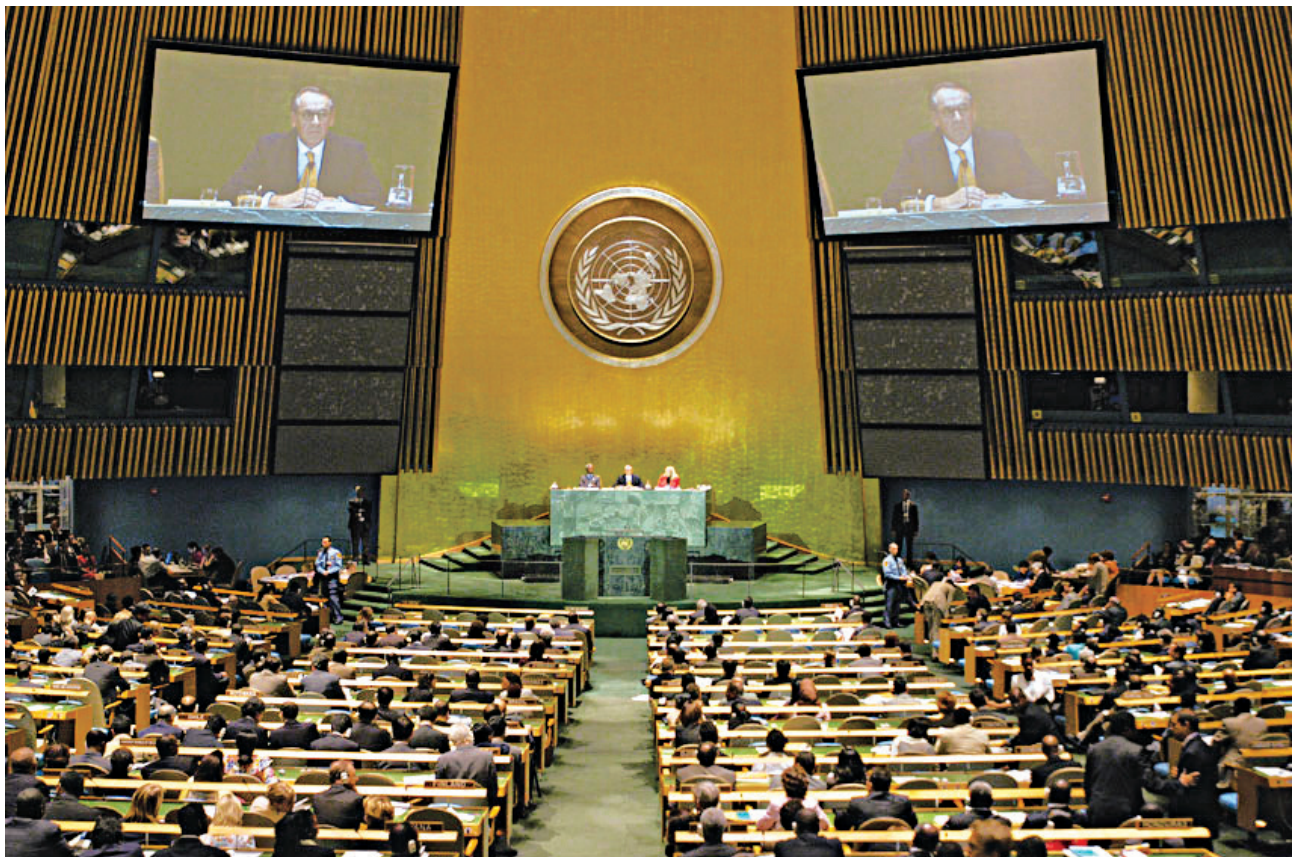
United Nations-General Assembly