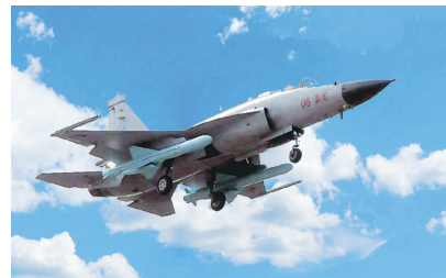
The Air Force