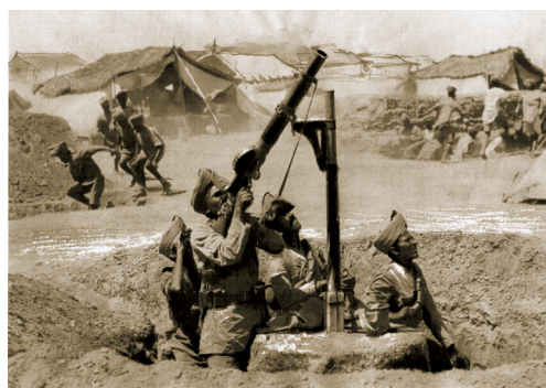
Indian Soldiers on a battlefield in the First World War

League of Nations was established after the First World War to establish peace. But it did not succeed at preventing war. Autocratic regimes came up in Germany, Italy, Spain and other countries. All these developments culminated in the Second World War.